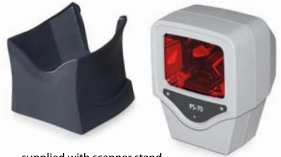
supplied with scanner stand